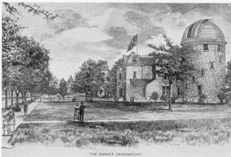
THE WARNER OBSERVATORY